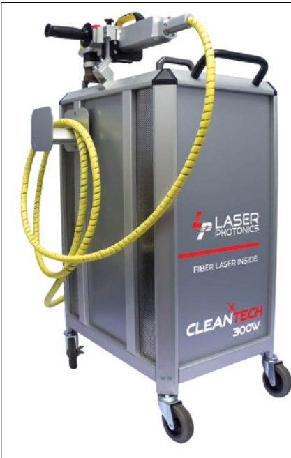
Laser systems remove corrosion with less preparation and mess than traditional techniques.

ing, and dispose of the waste. In addition, disposing of toxic chemicals is costly and closely regulated by agencies like OSHA and the EPA.