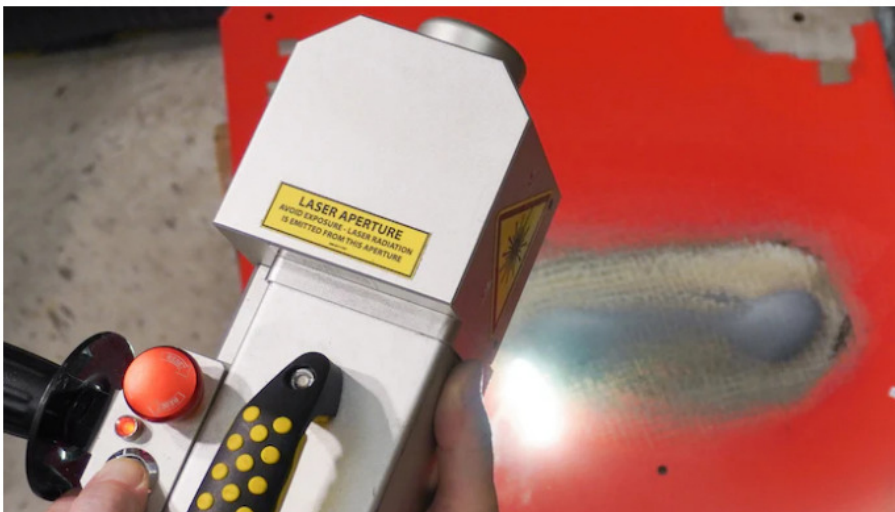
The technology minimizes operator exposure to potential environmental health hazards and no consumables are necessary.

Industries have been fighting a war against corrosion in metal infrastructure, equipment and products at great expense for generations.